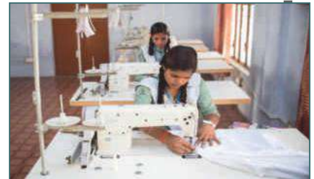
Facilitate Wealth Creation through employment