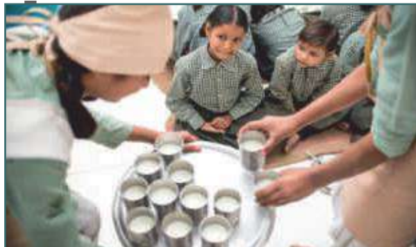
Promote Health and Hygiene